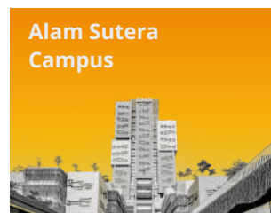
Alam Sutera Campus